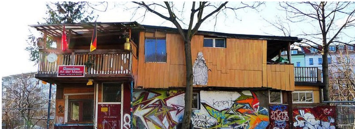
Baumhaus and der Mauer, Kreuzberg, Berlin

Note: By request it is possible to book Dönersafari as a classic guided tour with a duration of approx 2 hours, where we tell the most important stories from the Dönersafari.