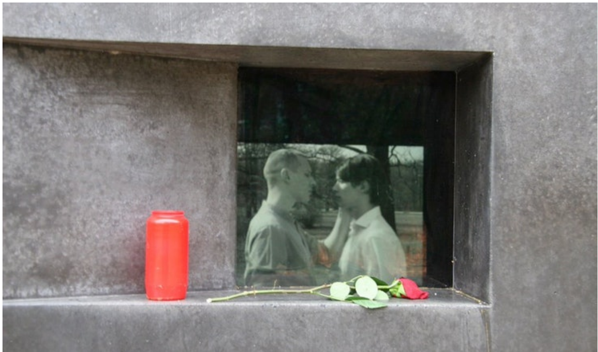
Memorial for the homosexuals persecuted under National Socialism, Tiergarten, Berlin

Start // stop: Reichstag, Tiergarten // Potsdamer Platz, Tiergarten.